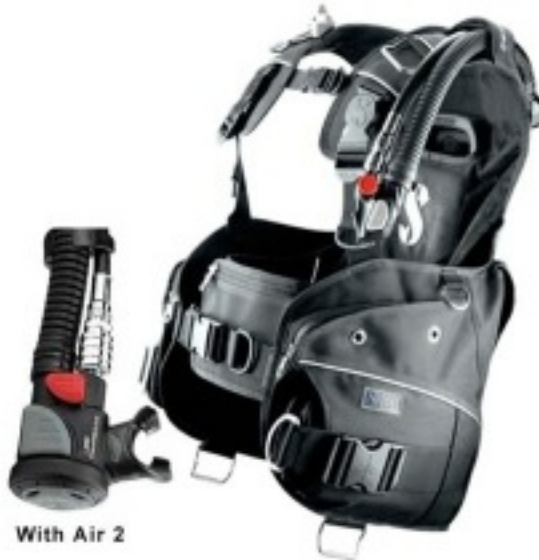
With Air 2

Combined with our ultimate piston controlled first stage , all in a jewel-colored deep blue PVD finish . The PVD finishing process also guarantees high scratch and corrosion resistance.