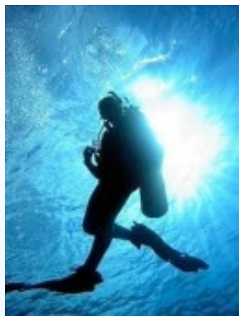
Diving for All

PLEASE SEND US YOUR DIVING PICS AND WE WILL POST THEM ON OUR NEWSLETTER, WEBSITE, AND FACEBOOK PAGE. HAPPY DIVING!!!